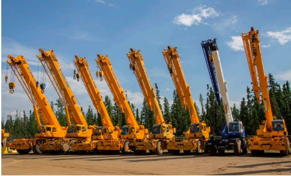
FLEET OF CRANES AS ON 30 TH JUNE 2018